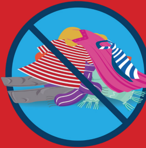
No textiles (take to the thrift store)