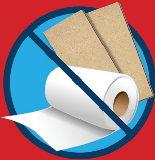
No paper towels or napkins (often soiled and too thin to recycle)