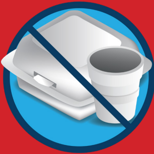
No Styrofoam (crumbles in the machinery)