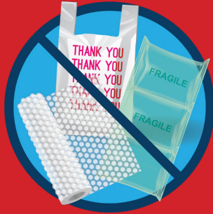
No plastic wraps, pillows or bags (tangles in the machinery)