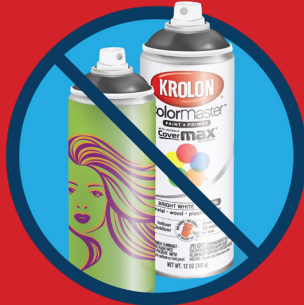
No aerosol cans (fire hazard)