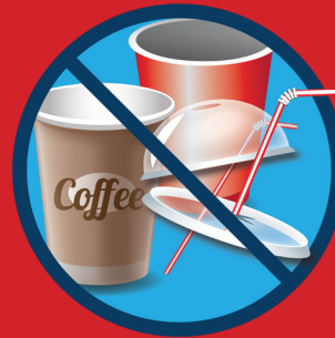
No paper cups, lids or straws (can't be sorted by the machines)