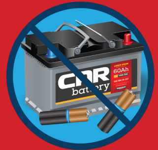
No household or car batteries (contain hazardous materials)