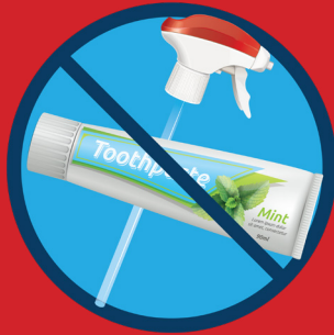
No pumps or tubes (made of multiple materials that can't be separated for recycling)