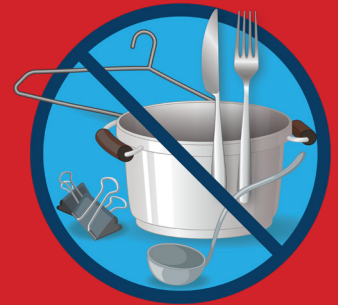
No scrap metal (harms the machinery)