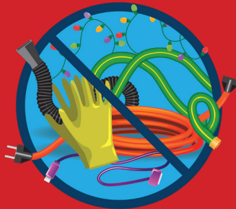
No tangles (cords, hoses, wires, etc. tangle in the machinery)