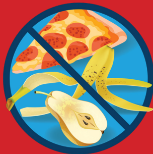
No food waste (contaminates the clean recyclables)