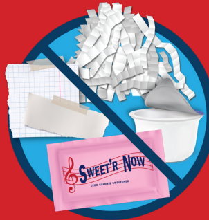
No small/shredded paper and packaging (small things are hard to sort)