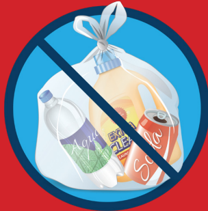
No bagged recyclables (keep them loose and free)

Don't tangle or contaminate. Recycle right with CVWMA!