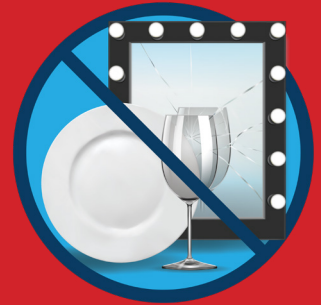
No household glass, mirrors or ceramics (can't be remanufactured)