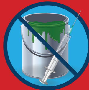
No hazardous or medical waste