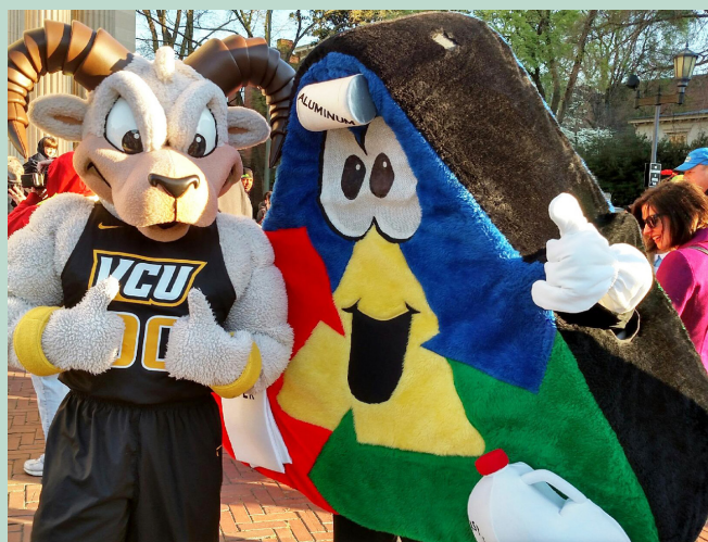
R3 and VCU's Rodney the Ram at the popular Virginia 529 Kids Run.