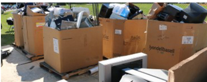
City of Richmond E-Cycling event.