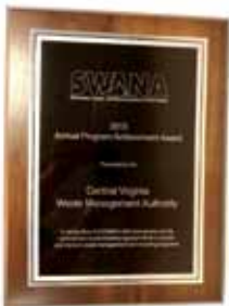
Solid Waste Association of North America 2015 Annual Program Achievement Award - Commitment to Coordinating Regional Efforts to Improve Waste Management and Recycling Programs

For 25 years, CVWMA's recycling successes have been spearheaded by dedicated staff and cost effective programs and we look forward to another quarter century, where recycling and solid waste management leads social, economic, and environmental advances in the region. We are proud of all that CVWMA has achieved and we look forward to the many opportunities that lie ahead.