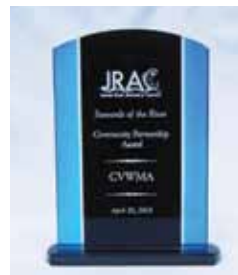
The James River Advisory Council's 2015 Stewards of the River - Community Partner Award