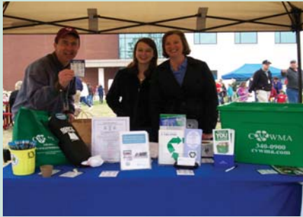
Chesterfield Environmental Fair