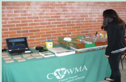
New Kent Envirothon Earth Day