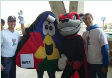
Education Day with Flying Squirrels