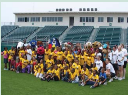
Richmond Kickers Spring Break Camp